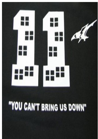
9/11 graphic on the shirts of the junior students.

A group of nine Detroit students are facing trouble for wearing self-designed t-shirts depicting a caricature of the 9/11 attacks on the World Trade Tower.